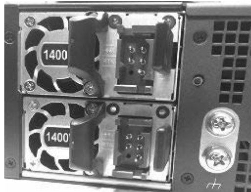
FIGURE 1 DC PSU